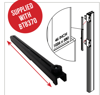
Screen spacer designed to eliminate calculations and guess work when installing horizontal rails